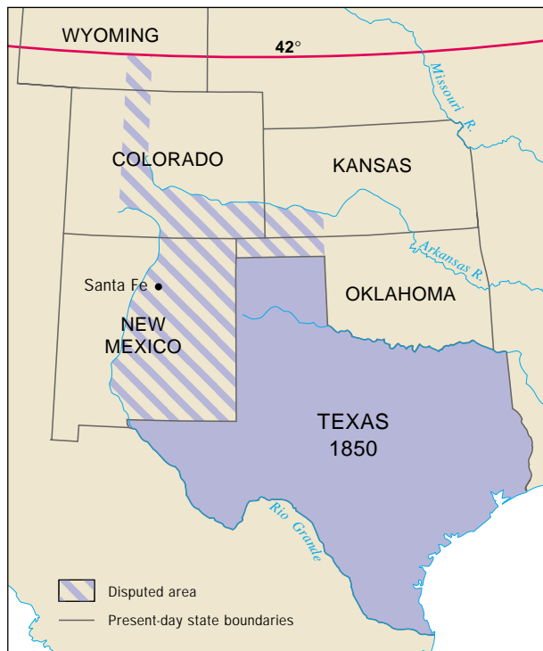
Texas and the Disputed Area Before the Compromise of 1850

Estimates indicate that the South in 1850 was losing perhaps 1,000 runaways a year out of its total of some 4 million slaves. In fact, more blacks probably gained their freedom by self-purchase or voluntary emancipation than ever escaped. But the principle weighed heavily with the slavemasters. They rested their argument on the Constitution, which protected slavery, and on the laws of Congress, which provided for slave-catching. “Although the loss of property is felt,” said a southern senator, “the loss of honor is felt still more.”