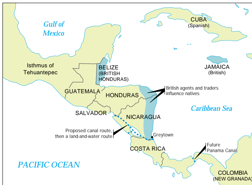
Central America, c. 1850, Showing British Possessions and Proposed Canal Routes Until President Theodore Roosevelt swung into action with his big stick in 1903, a Nicaraguan canal, closer to the United States, was generally judged more desirable than a canal across Panama.

Nicaragua was also of vital concern to Great Britain, the world's leading maritime and commercial power. Fearing that the grasping Yankees would monopolize the trade arteries there, the British made haste to secure a solid foothold at Greytown, the eastern end of the proposed Nicaraguan canal route. This challenge to the Monroe Doctrine forthwith raised the ugly possibility of an armed clash. The crisis was surmounted in 1850 by the Clayton-Bulwer Treaty, which stipulated that neither America nor Britain would fortify or secure exclusive control over any future isthmian waterway. This agreement, at the time, seemed necessary to halt the British, but to American canal promoters in later years, it proved to be a ball and chain.