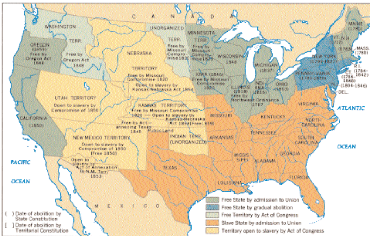
The Legal Status of Slavery, from the Revolution to the Civil War

sullen Yankees and shadowed by black-draped buildings festooned with flags flying upside down. One prominent Bostonian who witnessed this grim spectacle wrote that “we went to bed one night old-fashioned, conservative, Compromise Union Whigs and waked up stark mad Abolitionists.”