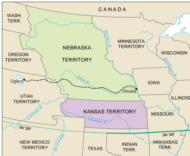
Kansas and Nebraska, 1854 The future Union Pacific Railroad (completed in 1869) is shown. Note the Missouri Compromise line of 36° 30' (1820).

Antislavery northerners were angered by what they condemned as an act of bad faith by the “Nebrascals” and their “Nebrascality.” All future