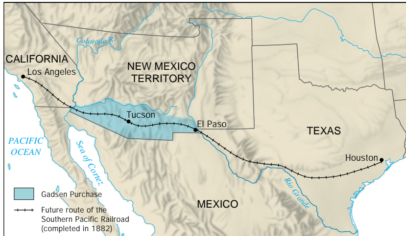
The Gadsden Purchase, 1853

in power for the sixth and last time, and as usual in need of money, Gadsden made gratifying headway. He negotiated a treaty in 1853, which ceded to the United States the Gadsden Purchase area for $10 million. The transaction aroused much criticism among northerners, who objected to paying a huge sum for a cactus-strewn desert nearly the size of Gadsden's South Carolina. Undeterred, the Senate approved the pact, in the process shortsightedly eliminating a window on the Sea of Cortez.